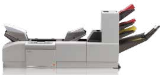
3 Documents + 1 Insert + Collator + Divert Tray