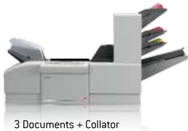
3 Documents + Collator

The DS-100 makes it easy to create professional, high-quality mail pieces, accommodating a wide range of envelope sizes to automate all your mailing needs. Its convenient modular design assures that your equipment investment is cost-effective today and into the future. That means peace of mind when considering potentially challenging job requests that lie ahead. Simply add the right module (up to 9 feeder stations) at the right time – as your company grows.